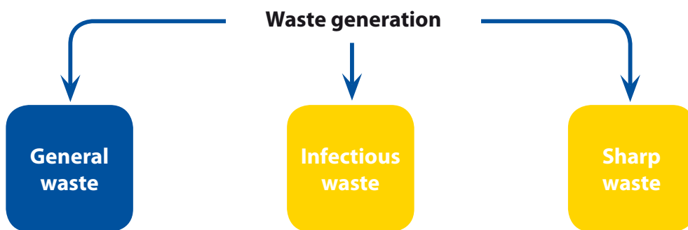
Figure 3.2 Three-bin segregation system

Basic three-bin system: The simplest and safest waste segregation system is to separate all hazardous waste from non-hazardous general waste (which is generally of a larger quantity) at the point of generation. However, to ensure staff and patients are protected, the hazardous waste portion is very commonly separated into two parts: used sharps and potentially infectious items. Consequently, the segregation into separate containers of general non-hazardous waste, potentially infectious waste and used sharps is often referred to as the “three-bin system”.