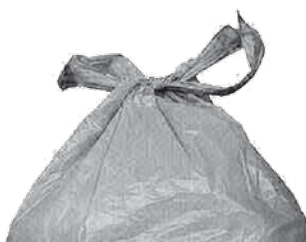
Figure 3.3 Exemplary bag tying

Waste bags/bins and sharp containers should be filled to no more than three-quarters full (or to the fill line on sharps bins when marked). Once this level is reached, they should be sealed, ready for collection. Plastic bags should never be stapled but may be tied in a knot or sealed with a plastic tag or tie. Replacement bags or containers should be available at each waste generation area.