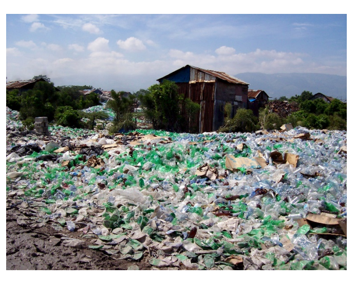
Plastic Waste in Haiti UNEP/OCHA JOINT ENVIRONMENT UNIT

Humanitarian assistance aims to save lives and alleviate suffering during and after emergencies and crises, as well as to strengthen preparedness. A key function of humanitarian assistance is the delivery of life-saving commodities and supplies to those seeking to survive and recover in post-disaster and postconflict emergency settings. According to the 2020 Global Humanitarian Outlook produced by the United Nations Office for the Coordination of Humanitarian Affairs (UN-OCHA), nearly 167.6 million people will need humanitarian assistance in 2020, representing approximately one in 45 people worldwide. The UN and partner organizations aim to assist 109 million of these people in need, which will require funding of $28.8 billion