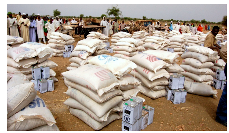
Food Packaging, Sudan LINEP

approach for standards of procurement. IFRC is also developing a "greening the supply chain" project that will assess how the organization can downsize packaging, use "greener" materials, cooperate with vendors to standardize packaging, encourage and adopt returnable packaging methods, and promote recycling and reuse. The ICRC has had a QSE policy for ten years that guides its logistics and procurement work, in particular for the technical specifications of relief items. UNEP supports member states in the