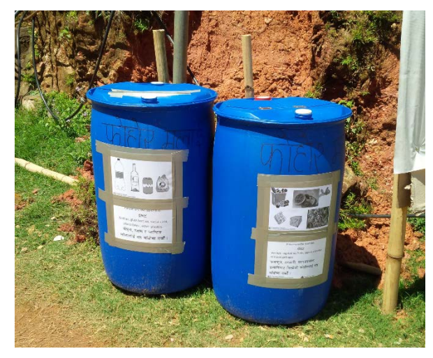
Recycling Waste in Nepal

many companies have undertaken significant plastics recycling efforts, and there are substantial ongoing humanitarian nutritional support and disaster risk reduction activities. However, numerous small-scale recycling schemes outside of the humanitarian community are also taking place in many assistancereceiving countries in response to the broader waste crisis. Such smaller schemes include recycling plastic bags and other plastic items into, for example, bricks for construction and hose pipes for irrigation. One company consulted introduced briquettes made of compressed cardboard and shredded PP bags to alleviate issues of fuel scarcity and waste in refugee camp settings. In some instances, humanitarian stakeholders are partnering with local entrepreneurs. For example, in Uganda and Colombia, UNHCR, in coordination with local entrepreneurs, is looking into