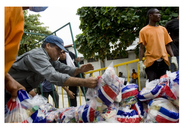
UNEP/OCHA JOINT ENVIRONMENT UNIT

The ways in which different types of assistance materials are packaged, transported, and stored significantly impacts the quantity and type of packaging needed. Consolidating and streamlining distribution can reduce transportation needs, improve warehousing efficiency, and ultimately reduce the quantity of packaging used. During consultations, stakeholders discussed opportunities for minimizing waste through the use of kits — which involve packaging various components of a set as one unit versus individual units — including shelter, kitchen, and hygiene kits. For instance, in