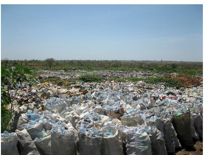
Plastic Bottles, IDP Camp in Haiti UNEP/OCHA JOINT ENVIRONMENT UNIT

National policies and standards influence the amount of plastic packaging throughout the humanitarian supply chain. New standards have already led to changes in humanitarian assistance stakeholders' operations and activities. Regulations that ban single use plastic or specific plastic items may cause stakeholders to rethink their procurement strategies in terms of where they source items and which items to procure and distribute. For example, plastic-related restrictions or bans in Kenya, Rwanda, and Tanzania that limit or eliminate the use, manufacture, and import of plastic films of a certain thickness (though more regulations may be forthcoming) have directly affected humanitarian assistance operations. Imports or deliveries that fail to