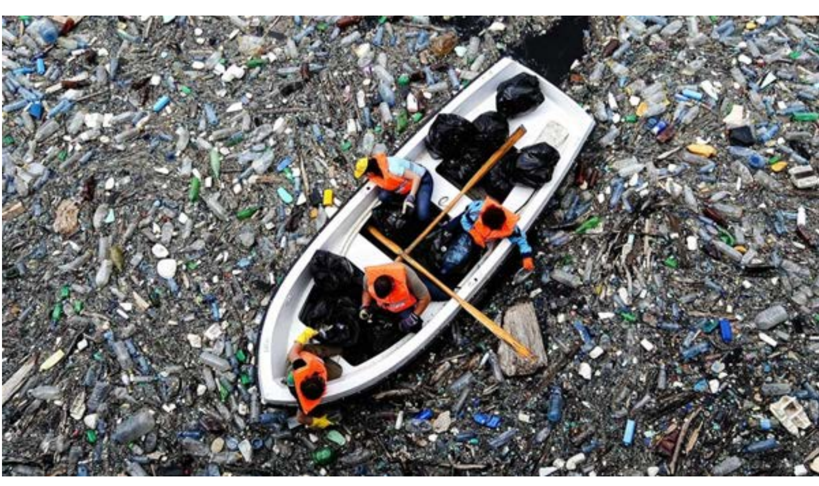
UNEP/OCHA JOINT ENVIRONMENT UNIT