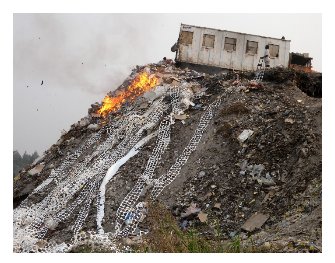
Burning Waste in DRC

Lack of funding for solid waste management: Lack of funding limits a country or implementing partner's ability to develop, implement, and enforce adequate solid waste management systems. Additionally, gaps in funding and uncertainty or disagreement about the organizations or sectors responsible for solid waste management mean that the issue can often slip between the cracks.