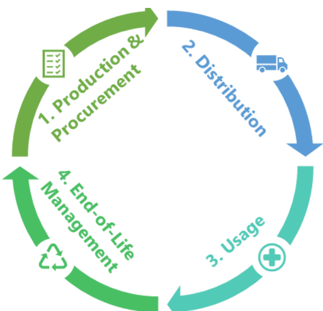
Figure I. Circular Economy

stakeholders undertake to acquire products from suppliers for ultimate distribution and use. Next is Distribution, which involves the processes by which humanitarian assistance stakeholders transport and disseminate food and non-food assistance to beneficiaries across the world. Usage is defined as the ability of beneficiaries and/or their communities to reuse or repurpose packaging waste for secondary applications. This step may repeat many times. The final stage of the supply chain is end-of-life management when assistance products, supplies, and packaging are no longer usable and require solid waste management efforts but can then be a resource for more production. This all aligns with Sustainable Development Goal (SDG) 12 of Sustainable Production and Consumption.