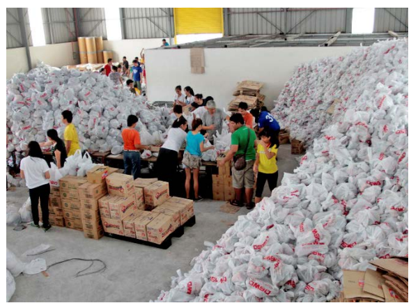
Food Distribution in the Philippines

The practice of surplus packaging presents a significant challenge to reduce packaging during the distribution stage. When deploying humanitarian assistance, organizations procure and distribute surplus goods to ensure that there is enough assistance to satisfy demand, even if confronted with logistical or operational challenges. Surplus is often sent to account for items damaged in transit. For instance, when shipping hygiene parcels, ICRC sends a three percent surplus of goods to protect against damage during transport. Similarly, WFP sends a surplus of cartons of two percent for commodities such as oil, biscuits, LNS and PP bags. This surplus is often not used, leading to waste of commodities and packaging. For example, WFP is recycling unused, surplus PP bags in their