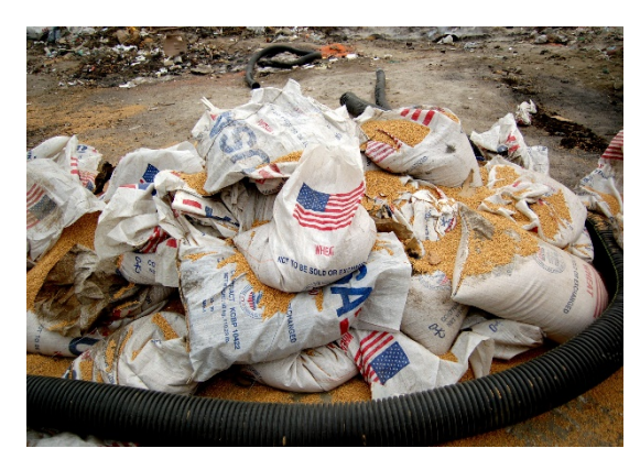
Food Waste in Afghanistan UNEP/OCHA JOINT ENVIRONMENT UNIT

Food assistance refers to both in-kind food commodities (i.e., food aid) and market-based activities, such as locally procured commodities or cash, that contribute to food security. Food assistance is mobilized in response to emergencies and crises where there is an identified need and local authorities lack the capacity to respond. Food assistance is used to save lives, reduce suffering, and support the early recovery of people affected by armed conflict, natural and man-made disasters. Food materials include oil, flour, grains, cereals and pulses, canned food, therapeutic foods, fortified foods, or nutrient supplements that provide life-saving support.